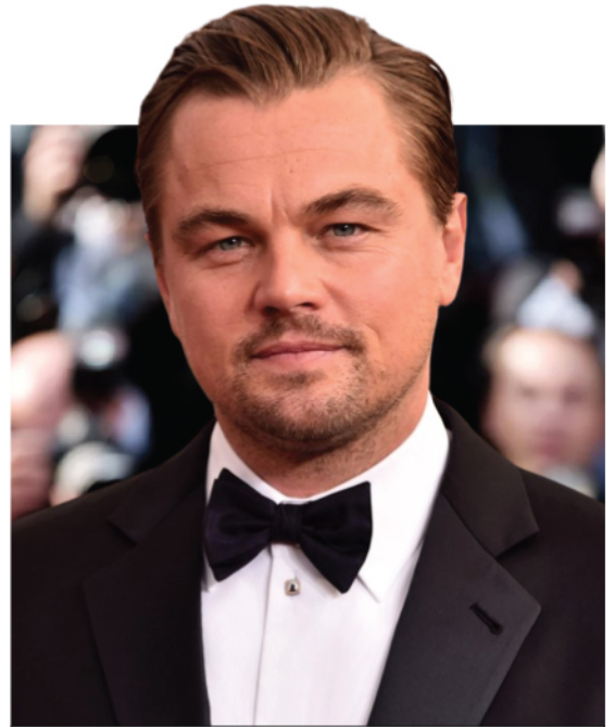
Academy Award-winning Actor